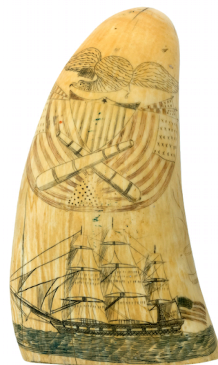
Polychrome patriotic scene tooth from the Kobacker Collection to be offered at Eldred's Auction. Length 6.25". See article on page 1.