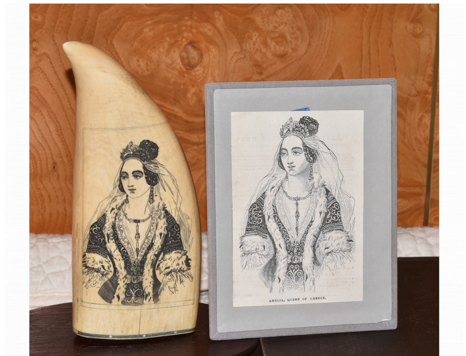
Queen Amalia tooth and source art.

In dating artwork such as scrimshaw, it's sometimes helpful to use fashion clues from the depicted style of clothing, accessories, hairstyle, etc. Amalia is wearing an ermine (type of weasel with white winter coat and black tail) fringed garment, such as those worn by nobles and monarchs for coronations and other special occasions. continued on p. 9