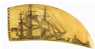
Lot 71, a 5 3 / 4 ” Britannia Artist rendition of the Daniel the Fourth of London, was the perfect example of the early confusion between the two

In keeping with the Burdett theme, the market for the formerly attributed Burdett-Britannia Artist teeth is taking shape.