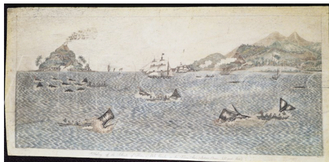
Panbone plaque by W. L. Roderick, inscribed “Whaling off the Islands of Flores and Pulo Comba in the Flores Sea, Indian Ocean (A Good Cut), dated 1858. 12 x 25 inches (30.5 x 66 cm.), National Library of Australia, Canberra.

What is truthfully known about W. L. Roderick is that he was ship's surgeon on three South Sea whaling voyages in the bark Adventure of London during 1847–56; that some of his meticulously rendered panbone plaques and sperm whale teeth featuring highly proficient, distinctively engraved sperm whaling scenes are signed and dated; and that some have explicit inscriptions identifying context and locale. However, what has not generally been realized is that his outstanding masterpiece, a panbone plaque in the National Library of Australia (NLA), inscribed “Whaling off the Islands of Flores and Pulo Comba in the Flores Sea, Indian Ocean (A Good Cut),” is signed and dated 1858, which was actually two years after his last known whaling voyage in the Adventure , suggesting that he may have made at least one additional voyage that has yet to be discovered—or that he continued to do scrimshaw even after he swallowed the oar in 1856.